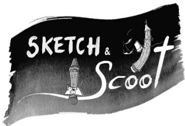
ILLUSTRATION EXPLORATIONS TYPICAL SCHEDULE